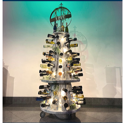
Winner for Most Creative Tree