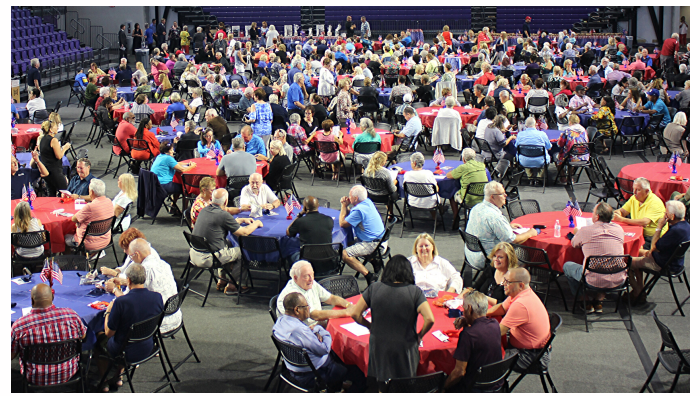
Lee County poll workers at the Suncoast Credit Union Arena at FSW.