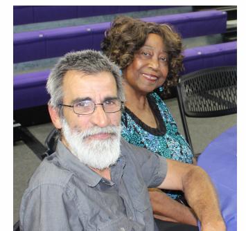
Lee County Poll Workers