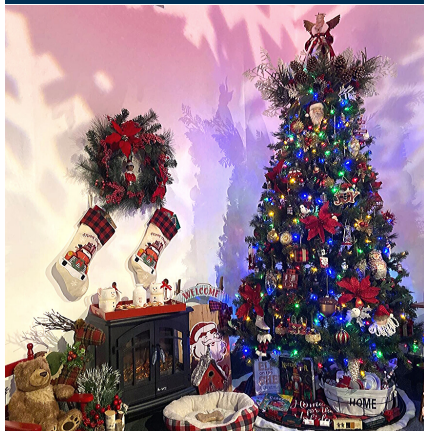
Winner for Best All Around Tree & Most Traditional Tree